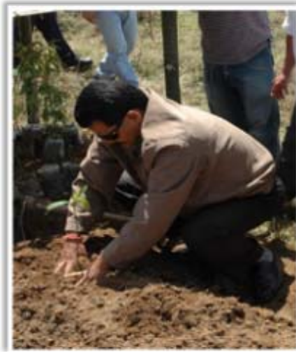
Ex-minister of Forest, Shri. S. B. Subedi planting a sapling