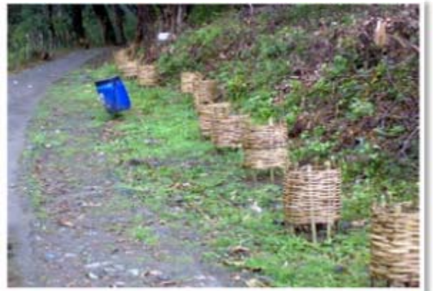
Protection of Plantation by bamboo basket