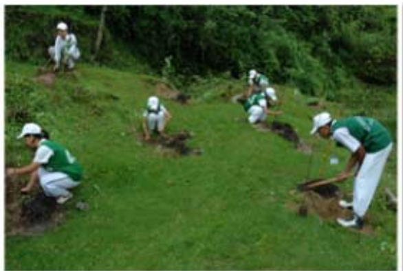
Volunteers in action