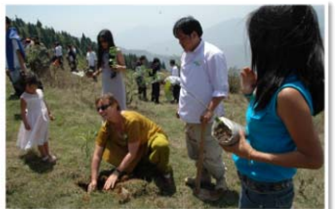
A Kid on the left watches an inspired tourist planting a sapling