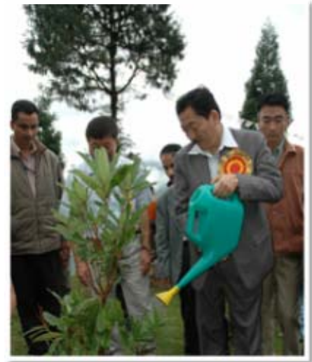
Hon'ble Chief Minister of Sikkim watering the plantation