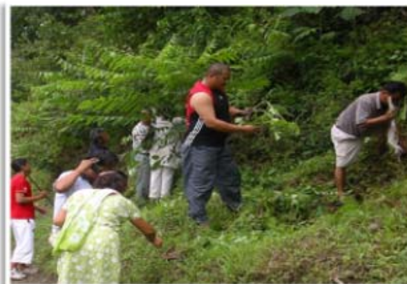
Volunteers in action at Namchi – Damthang road, South Sikkim