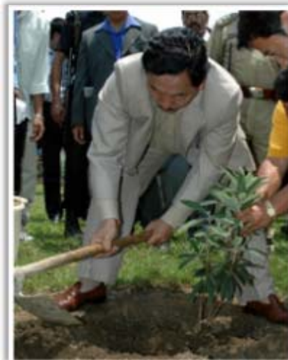
Nation's Greenest Chief Minister, Shri. Pawan Chamling planting a sapling