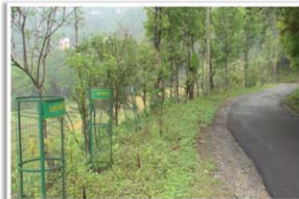
Well Protected Avenue Plantation along the Pakyong - Andheri Road, East Sikkim