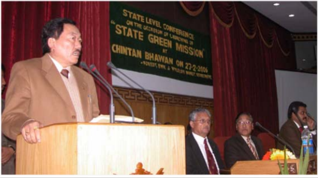
Launching of Sikkim Green Mission on 27 th February 2006

A Unique Innovative Environment Programme Launched in Sikkim