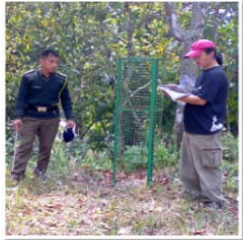
Forest Officials documenting the status