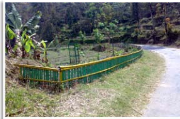
Protective Fencing along the roadside plantation at West Sikkim